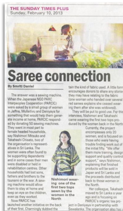
Sunday Times (Feb 10, 2013)

In Jaffna we will have two Japanese volunteers for the better designing and pattern making in July. They will stay in Jaffna and work with our women for three months. We hope we will show the "UP Cycling" products made by the women in the next report soon. We are looking for the places where we can sell their products. If you are interested in adding some of them to your shop or showroom, please contact us !!!