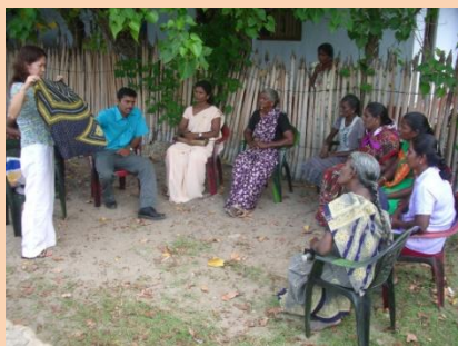
Meeting with the women in Manatkaadu, Vadamarachchi east

We are working with 13 women from 2 villages in Jaffna at this moment. We organized the women's group with 6-7 women in each village in April of this year. All of them were already given the sewing machines and have gotten the basic sewing trainings by PARCIC and other agencies. They have been working as tailors at home but their income is neither stable nor enough for their daily life. Their monthly income from sewing work is SLR. 1000-5000. Only in the big festival time such as Deepavali, they can earn more. They sincerely wish to improve their sewing technic and earn more income through this project. Therefore, since this May with a great motivation, women have started to improve their sewing technic with teacher employed by PARCIC.