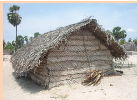
One of the women's temporary houses in Jaffna made with Palmyra leaves. Still many people live in this kinds of temporary houses.

Women working for this project live in Vadamarachchi east DS division in Jaffna. Most of them experienced the displacement from their own houses several times due to the civil war and the tsunami. After the end of the civil war in May 2009, they lived in the camp for one and half years and returned to their own villages in October 2010. Since last year the projects for constructing the permanent houses have been going on and some of them have gotten permanent houses, but still many people live in temporary housing with Palmyra leaves. Still they do not have electricity at home in this area. People are trying to rebuild their life little by little.