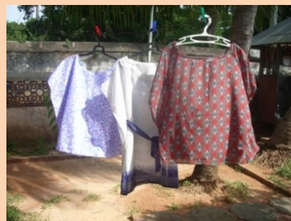
Blouses made by women!