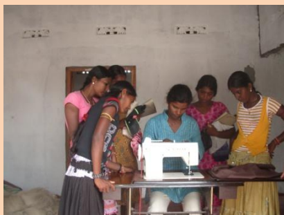
Sewing class in Uduthulai, Vadamarachchi east